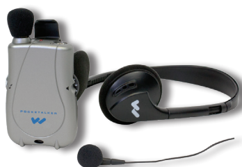
Personal Assistive Listening Systems