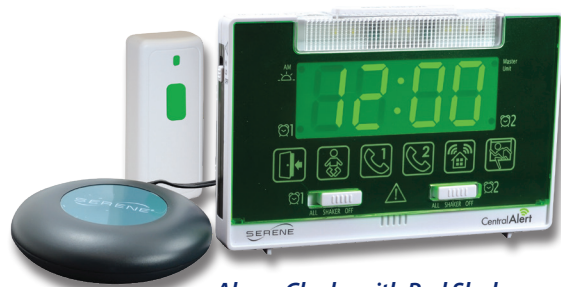
Alarm Clocks with Bed Shaker, Flashing Lights and Loud Ringers