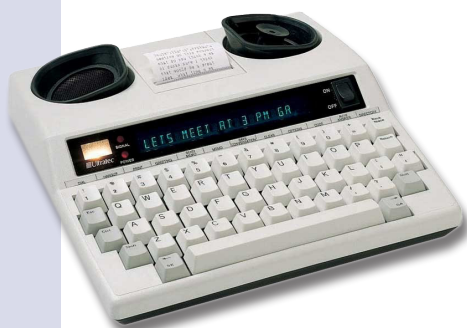
Text Telephones (TTY)